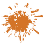
Layer 2 Cinnamon Swirl