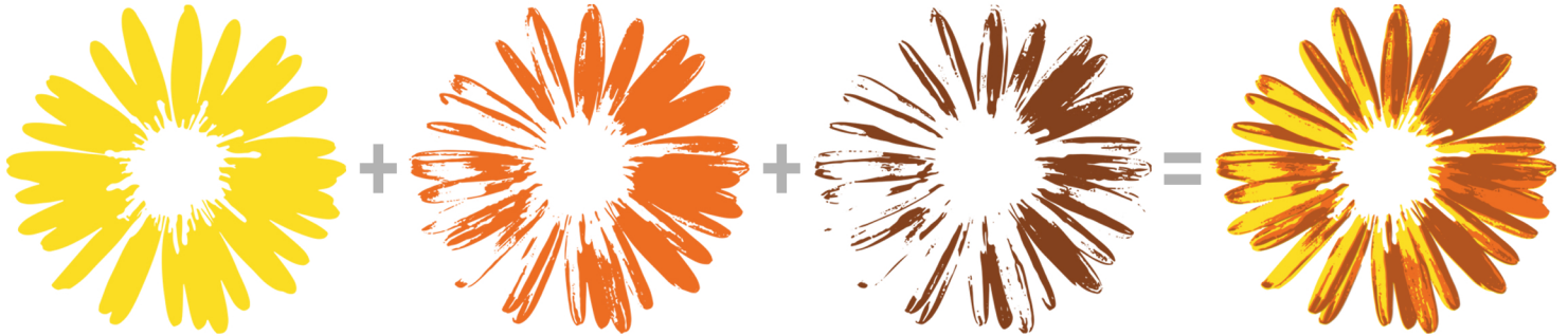
Layer 1 Canary Yellow

Follow the guides below to build your own Layering Asters. We've included some colour suggestions from our Prism Ink Pad range.