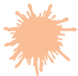
Layer 1 Apricot Sorbet