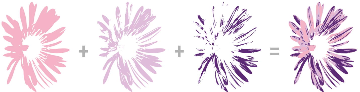
Layer 1 Pink Jellybean